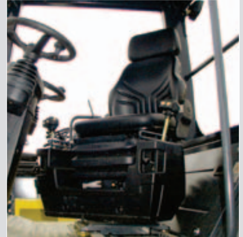
Seat can be moved laterally from side to side or swiveled through 180°.