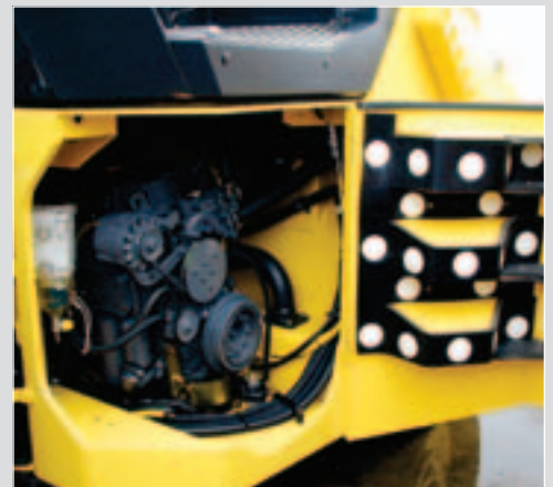
Easy access to engine and hydraulic components from either side.