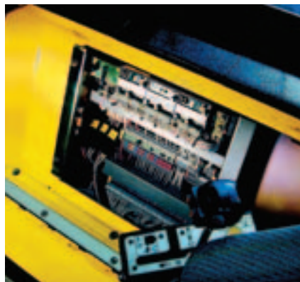
Centralized electronics with Modular Circuit Technology