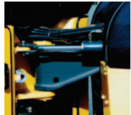
Centerpoint articulated steering with standard crab steer off-set provision.