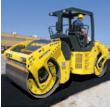
Improved visibility and sliding/swiveling seat result in greater operator productivity.