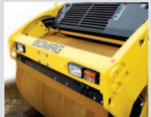
Two spring loaded scrapers per drum allow easy cleaning and replacement.

With these features and many more, it's easy to see why these models maintain a high residual value while delivering lower lifetime operating costs.