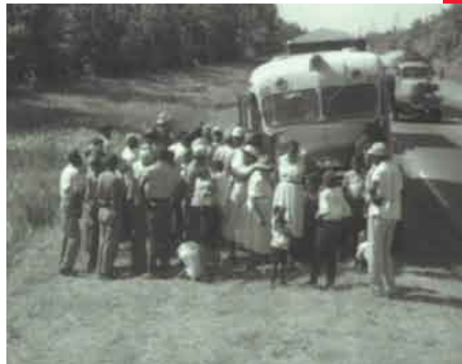
The documentary "Harvest of Shame," broadcast by CBS in 1960, called America's attention to the callousness with which U.S. agricultural giants treated migrant farmworkers.

The DOL's wage and hour division had earlier documented what it called "a woeful history of labor violations," including unsafe living and working conditions and wage abuses. Yet the forestry contractor continued to receive permission to import guestworkers. When the DOL's Employment and Training Administration refused to cancel guestworker services to this employer, North Carolina's monitor advocate, a state official who is supposed to enforce farmworker rights, filed a complaint with the DOL's inspector general. A year and a day after the filing of that complaint, 14