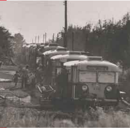
Migrant workers historically have lived in squalid conditions. Here, old buses were used to house workers in the 1950s.