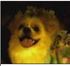
Rox - 2-4-year-old male Pekingese