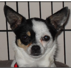
Chloe - 3-year-old Chihuahua