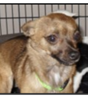
Pablo - voung adult Chihuahua