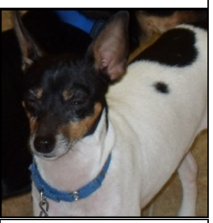
Annie - 1-vear-old fox terrier