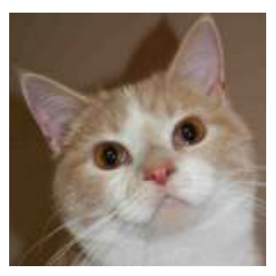
Chubby Huggs (Zane)