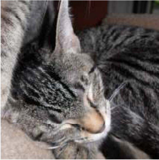
Brinn, 4 months