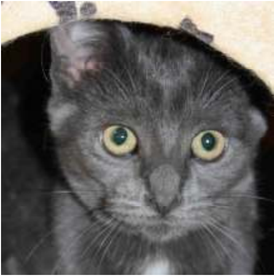
Mya, 1 year