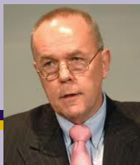
Hon Justice Lex Lasry