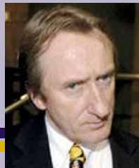
Alan Howe Herald Sun newspaper