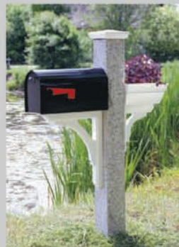
Shown with our wood bracket, wood cap and flower box