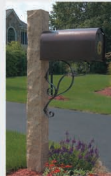
Shown with our 155 iron bracket