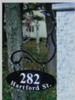
Oval Sign with 125 Iron Bracket