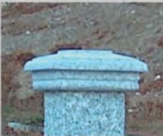
66 Cap Granite Cap