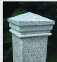
New-GCA granite colonial cap