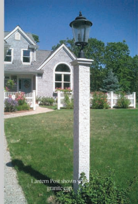
Lantern Post shown with granite cap