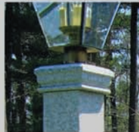
GCB Granite Cap