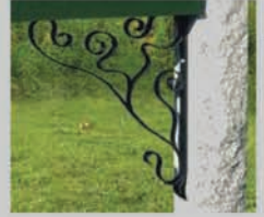
255 iron bracket available in black or copper