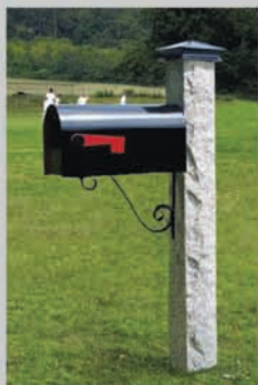
Shown with our 106 iron bracket

Traditional granite post. You can't go wrong with this post which has been the tradition of New England for many years. Two sides have a smooth thermal finish and the other two sides have a natural rock finish. This post looks great in a variety of applications and in combination with our wood or iron accessories.