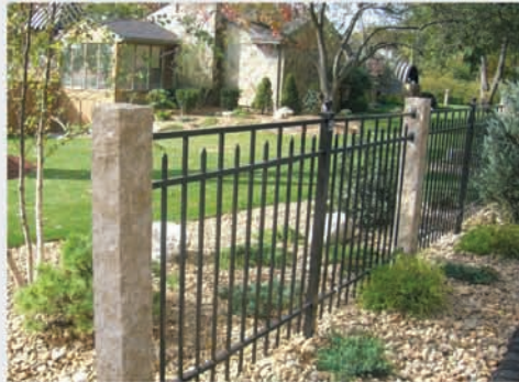
Golden Wheat posts with iron fence