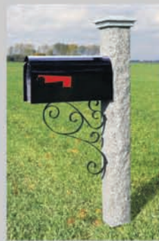
Shown with our 135 iron bracket & iron cap