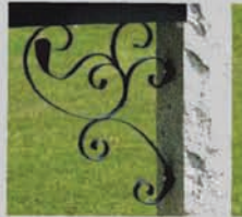
145 iron bracket available in black