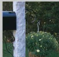
155 Iron Planter Bracket