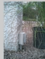
Pre-wired Lantern Post with GFCI outlet