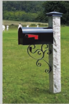
Shown with our 145 iron bracket and iron cap