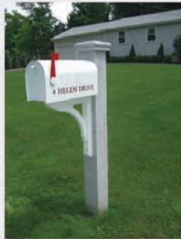
Shown with our wood bracket and granite cap

This unique granite post and cap was designed by Boston Architect Mark Sangiolo exclusively for Westwood Mills. It's thermal fluted finish can be admired on all 4 sides. This elegant granite post captures the details and beauty of the traditional colonial home.