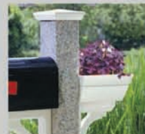
Wood Flower Box