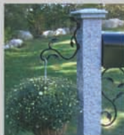
125 Iron Planter Bracket