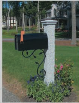
Shown with our 125 iron bracket and granite cap