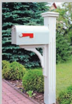
Shown with our wood bracket and wood cap