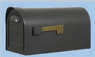
Cast Aluminum Mailboxes

Available in Black, White, Green and Copper