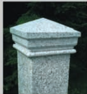
GCA Granite Cap