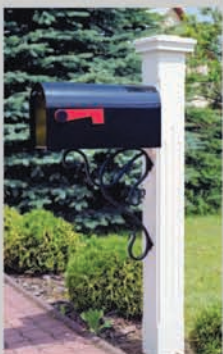
Shown with our 125 iron bracket and wood cap

Traditional wood post. It's fluted finish compliments any traditional colonial home. This post looks great in a variety of combinations with our wood or iron accessories.