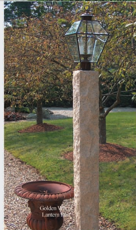
Golden Wheat Lantern Post