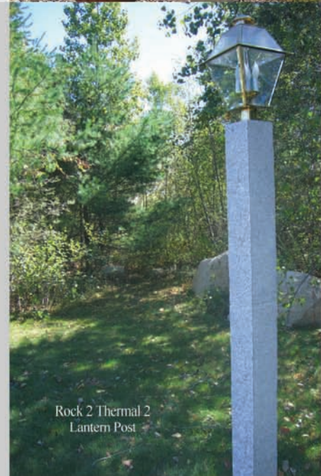
Rock 2 Thermal 2 Lantern Post