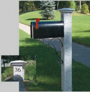
Shown with our 155 iron bracket and granite cap

Our most popular and most economical granite post. Most admired for its unique pineapple finish on all four sides. Great for a variety of applications including mailbox, fence, hitching and lantern posts. Available in 6"x6" and 8"x8".