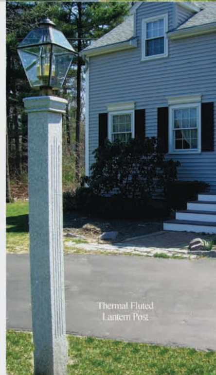
Thermal Fluted Lantern Post