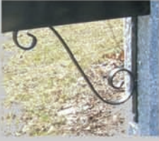
106 iron bracket available in black