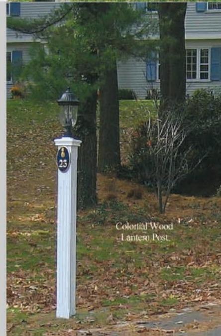
Colonial Wood Lantern Post