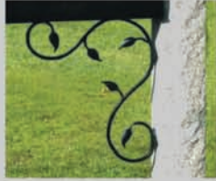
125 iron bracket available in black or copper