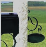
Oval Sign with 155 Iron Bracket