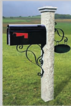
Shown with our 155 iron bracket, oval sign and granite cap