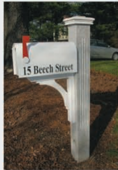
Shown with our wood bracket and wood cap