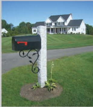
Shown with our 125 iron bracket

New England charm at its best. Finish off your landscaping with this lustrous gray granite post with a natural rock finish on all four sides. Whether as a fence post, hitching post, mailbox post or lantern, you will enjoy its beauty and durability for years to come.