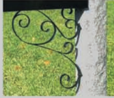
135 iron bracket available in black