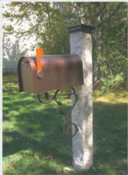
Shown with our 125 iron bracket and iron cap

Looking for some old New England charm. This beautiful granite post comes with a natural rock finish on all four sides and would be a great addition to your New England landscaping. These posts look great with a Westwood Mills exclusive copper colored iron bracket, cap and mailbox.