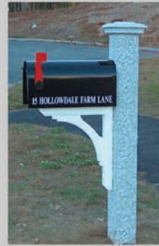
Shown with our wood bracket and granite cap