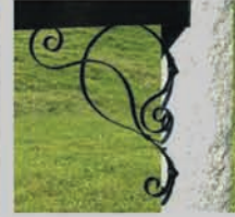
155 iron bracket available in black or copper