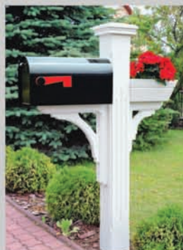
Shown with our wood bracket, wood cap and planter