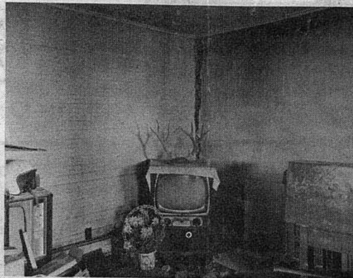
At left, living room in a house near Ludlow in eastern Colorado, July 6, 1999. Below, a gymnasium in a WPA-built school in Wheatland in eastern New Mexico, July 17, 1992. STEVE FITCH

Gone: Photographs of Abandonment on the High Plains by Steve Fitch 175 pages, paperback $24.95. University of New Mexico Press, 2003