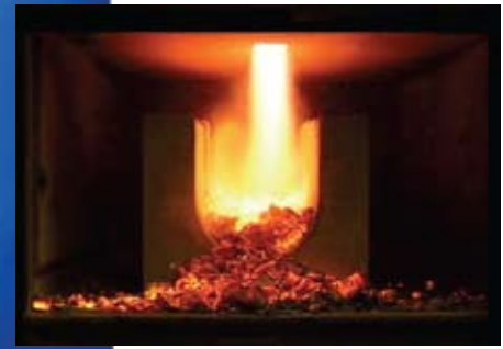
Actual Econoburn™ Combustion Chamber