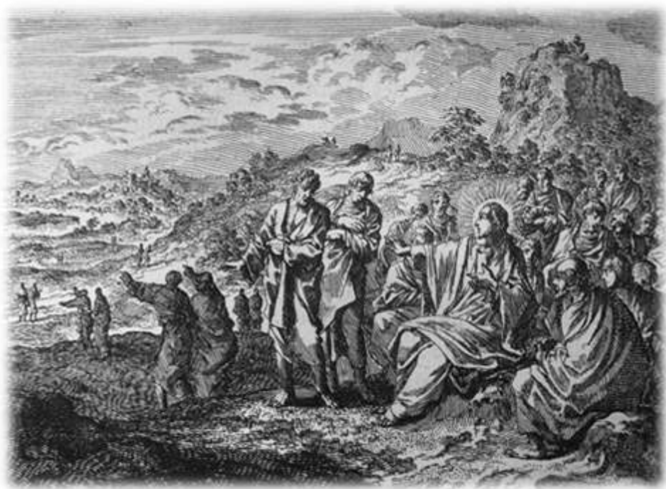
Jesus Sends Out the 72