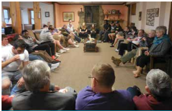
Friends who came to help us on our spring service day gather for prayer and ready themselves for the day of projects.