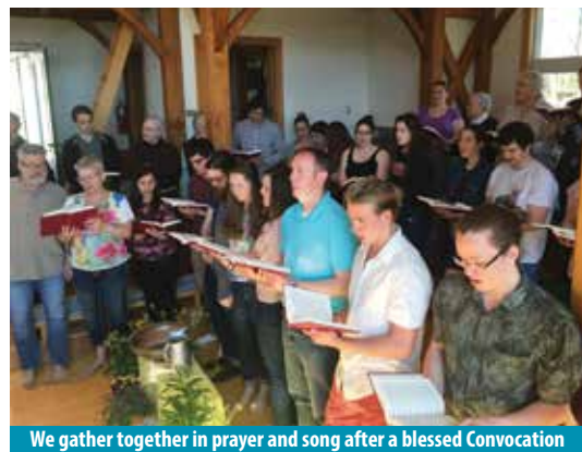
We gather together in prayer and song after a blessed Convocation Weekend of work and reflection.

We welcome others to join us as we renew our Council for Spirit and Life. Still gaining organization and members, the Council is considered a body to support the growth of the Mountain gatherings elsewhere. We want "recipes" and resources for "Mountain in the Home" as well as true