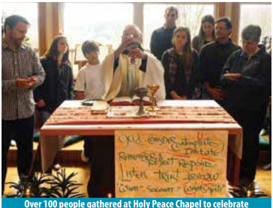
ver 100 people gathered at Holy Peace Chapel to celebrate the Eucharist during our Convocation.