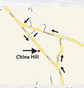
Business Hours: Sunday through Thursday 11:00 A.M. to 9:00 P.M. Friday and Saturday 11:00 A.M. to 10:00 P.M.