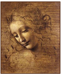
Figure Painting with Kamille Corry