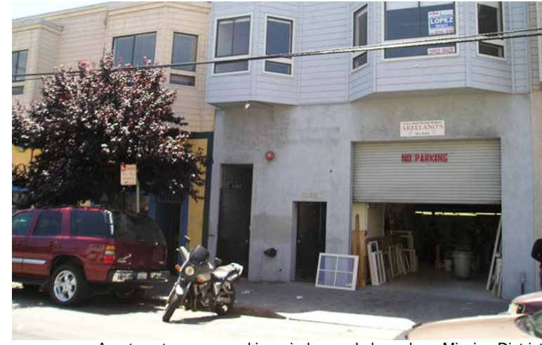
Apartments over a working window and glass shop, Mission District