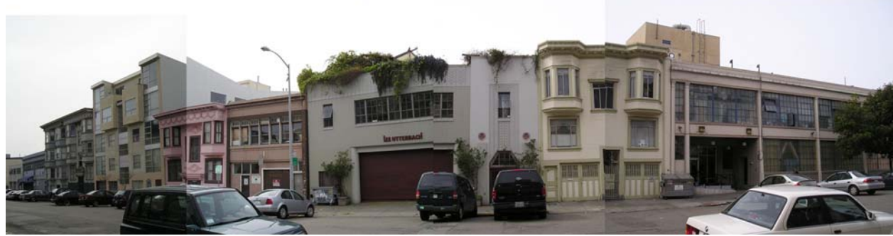
Horizontal integration in a South of Market street

In discussing guidelines for a mixed-use Industrial/Residential neighborhood, a key question is how to guide the integration of different types of use such that conflicts and nuisances avoided, and a vibrant healthy neighborhood is encouraged. Thus, the recommendations listed below are grouped around types of integration, "horizontal" and "vertical," and are based on observed patterns in successful living/working environments in San Francisco.