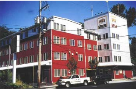
"ActivSpace" locations in Berkeley and Seattle

Financial Feasibility. Affordable developers, unless they are developing in a strong retail market area, rarely factor in ground floor rents into their financials; this would probably also apply to industrial ground floors. Note that current industrial rents are relatively marginal compared to retail or office, with lease prices ranging from $0.75/sf to $2.00/sf in 2006. The lower end rents typically apply to larger unimproved warehouse spaces (over 10,000 sf). The design considerations discussed below add some cost to construction. Since the purpose of this zoning is to promote marginal-rent industrial uses, the increased costs (for example, for ventilation and waste disposal) may likely be borne by the developer rather than as part of the industrial users tenant improvement costs. An emerging market for small "incubator spaces" (as small as 300 sf) is appearing at the higher end of the light industrial market. One example is "ActivSpace," a west coast developer of small industrial spaces, currently building at 18<sup>th</sup> and Treat in the Mission District (http://www.activespace.com/). While these kinds of "hobby industry" spaces may be appropriate for vertically integrated buildings, they may not be what's desired to mitigate the displacement issues in the transitioning mixed-use industrial areas.