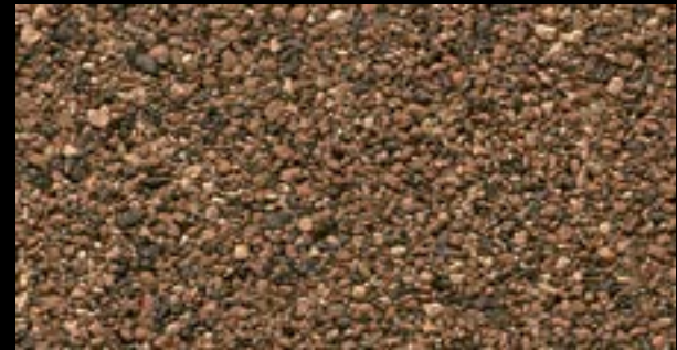
RUSTIC CEDAR ●◆