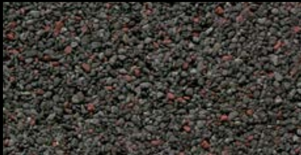
SLATETONE GREY ●