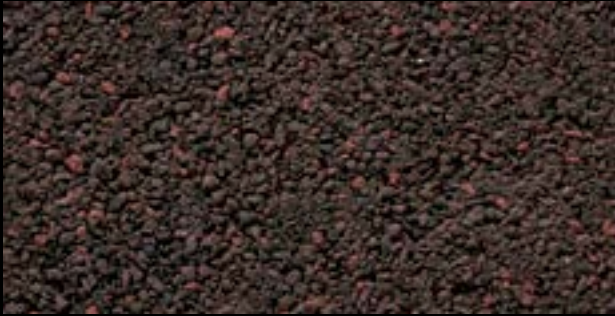
RUSTIC REDWOOD ●◆