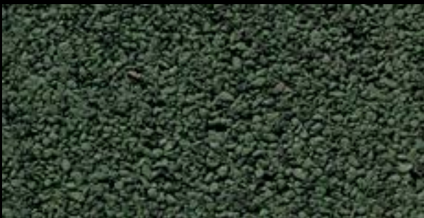
EMPIRE GREEN BLEND ●