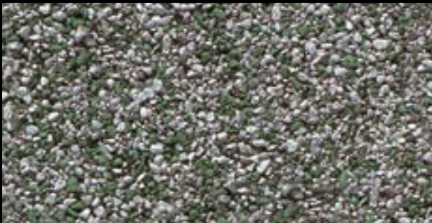
PASTEL GREEN ●