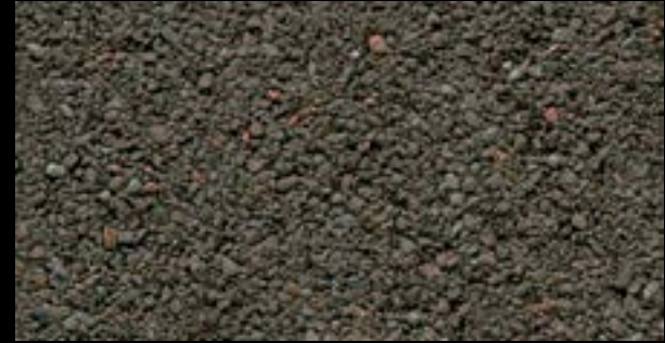
WEATHERED WOOD ●◆