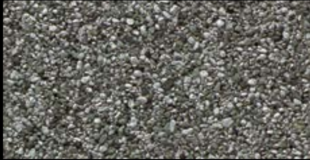
GREY BLEND ●