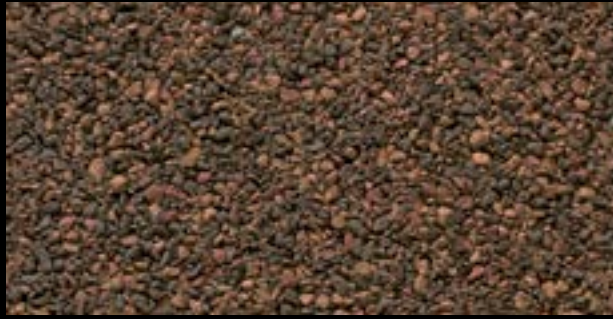
TWEED BLEND ●◆