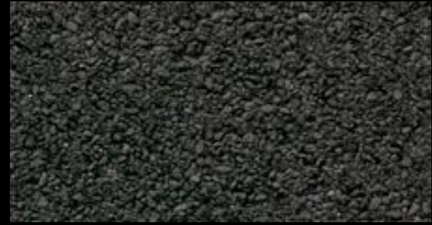
RUSTIC BLACK ●◆