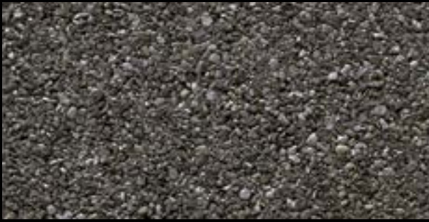
ANTIQUE SLATE ●◆