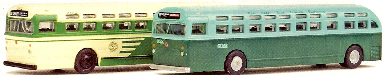
Wheels of Time has created an outstanding vehicle replica in N scale. These Mack C-49DT transit buses are real gems and it's easy to see why they won the New Vehicle of the Year award from the N Scale Vehicle Association.

Wheels of Time also very thoughtfully produces multiple unit numbers and unnumbered versions for each livery. In addition to the Muni and NYCTA versions, the current double-door offerings include: Boston MBTA, Chicago Transit Authority, LA Transit, Milwaukee & Suburban Transport Co., Alameda-