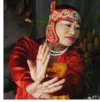
Myanmar Magic: Tell a Joke, and You Disappear