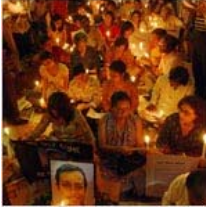
A Tale of Tragic Love Cracks Calcutta's Mirror