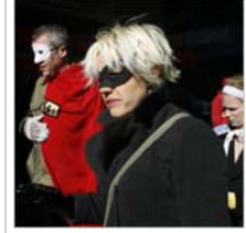
Masked and Caped, Crusading for a Cause

Home | World | U.S. | N.Y./Region | Business | Technology | Science | Health | Sports | Opinion | Arts | Style | Travel | Jobs | Real Estate | Automobiles | Back to Top Copyright 2007 The New York Times Company | Privacy Policy | Search | Corrections | RSS | First Look | Help | Contact Us | Work for Us | Site Map