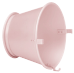
Type 5316 Snoot and Diffuser Holder