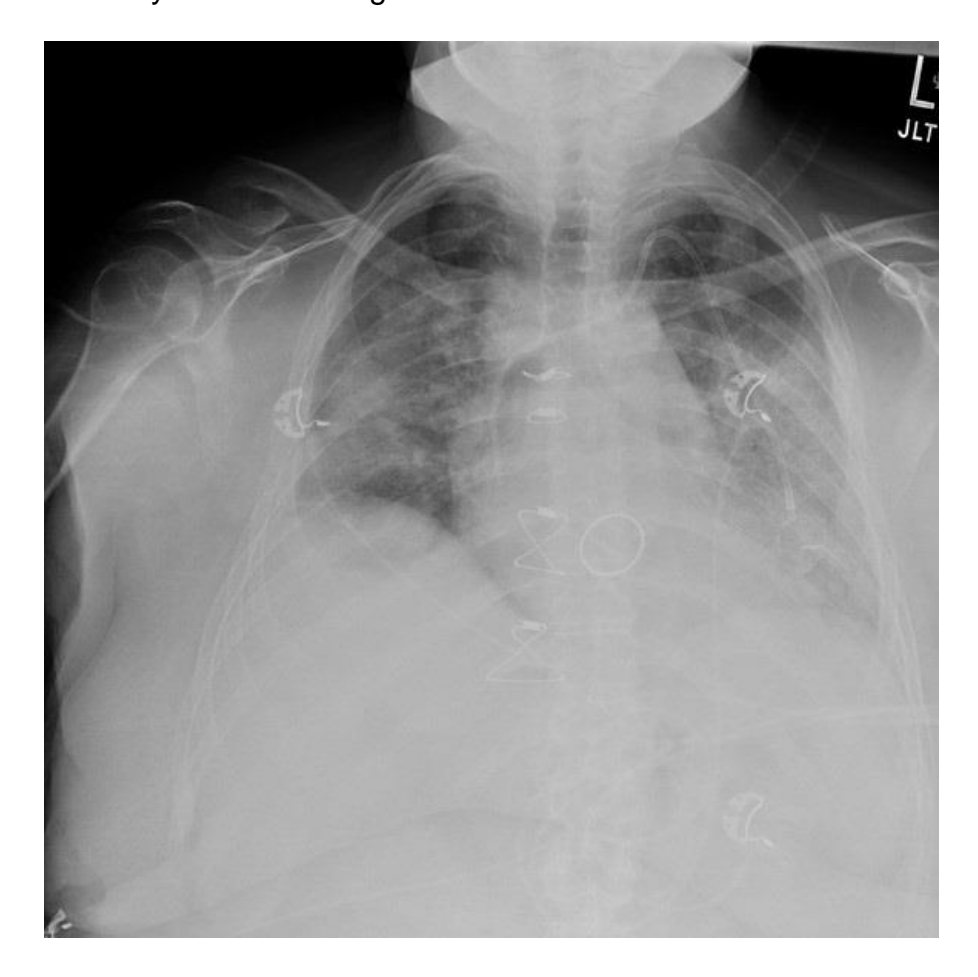
Figure 1. Initial chest radiograph.

Her initial chest x-ray is shown in Figure 1.