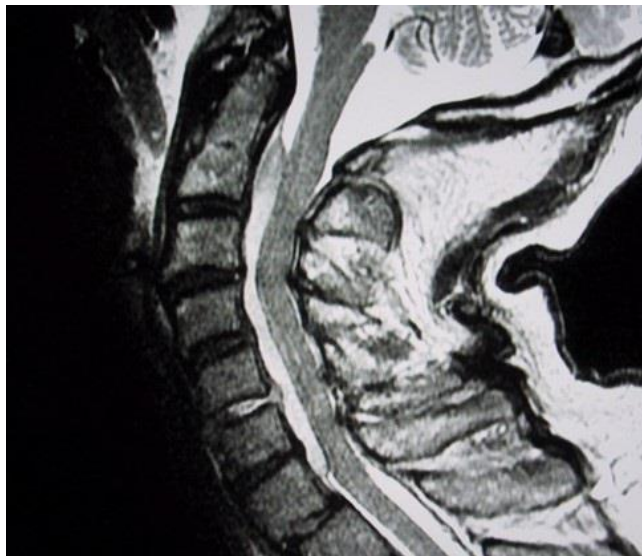
Figure 1. Representative view of MRI of the neck.

The lumbar puncture fluid is not normal with an elevated WBC count and protein but a normal glucose and no organisms seen on Gram stain. Empiric antibiotics of ceftriaxone and vancomycin were begun. A transesophageal echocardiogram did not show evidence of endocarditis. The head CT was reviewed with the radiologist who saw no abnormalities within the cranium. However, given the clinical presentation he suggested an MRI of the head and neck which was performed (Figure 1).