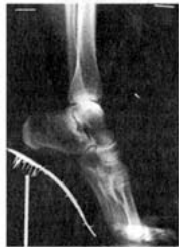
Susan Kingsley Aesthetic Prosthetic

Bones — fragile, misshapen, diseased and healed — are the subject of an art exhibit that opened Jan. 22 at the United Nations. The artists are orthopedic patients, the doctors who treat them or people whose lives have been touched in some way by the human orthopedic condition. The “Crouching Figure” at right reflects an artist’s struggle with scoliosis. In “Structural Abnormalities,” top far right, an artist depicts his painful disorder, Gaucher’s disease, with a skeleton trying to break free from an uncomfortable space. The works of 85 artists, which are on an international tour, will be on display in the visitors’ lobby of the General Assembly through Feb. 26. “eMotion Pictures: an Exhibition of Orthopedics in Art” was created and produced by the American Academy of Orthopaedic Surgeons.