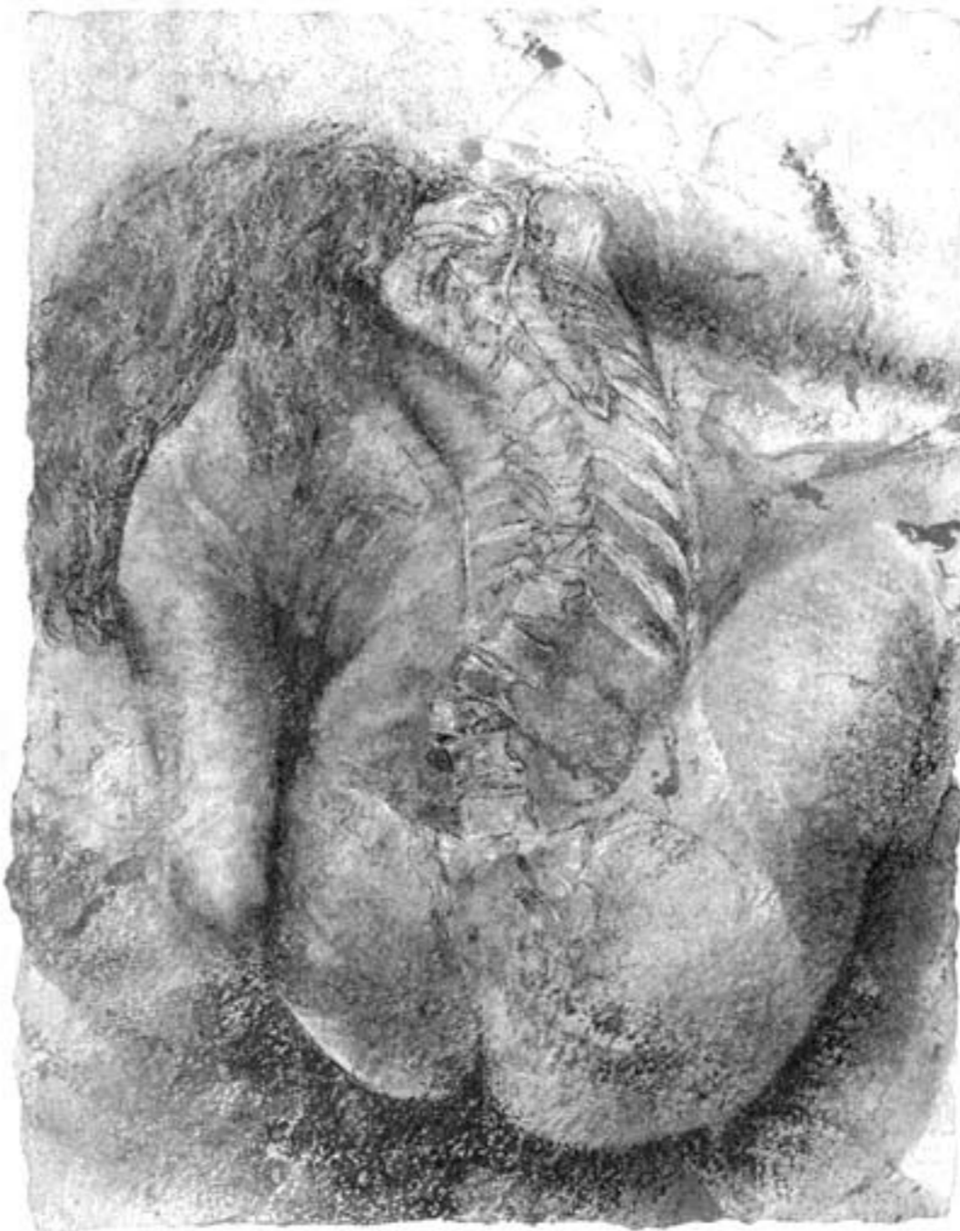
Laura Ferguson Crouching Figure With Visible Skeleton