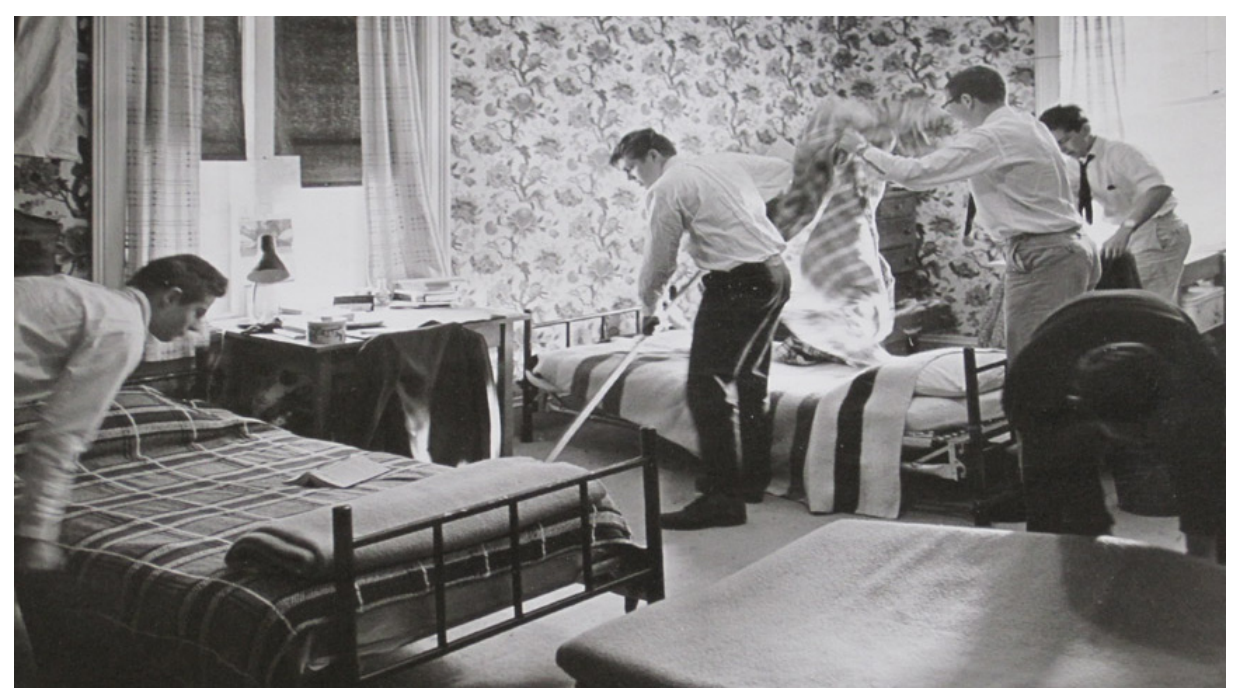
"C'mon, were we ever this organized? This must have been staged!" Boys were always expected to keep their rooms clean and well maintained, as verified by frequent room inspections with "appropriate punishment" if standards were not met. Anyone for calisthenics, runs, or work squads?