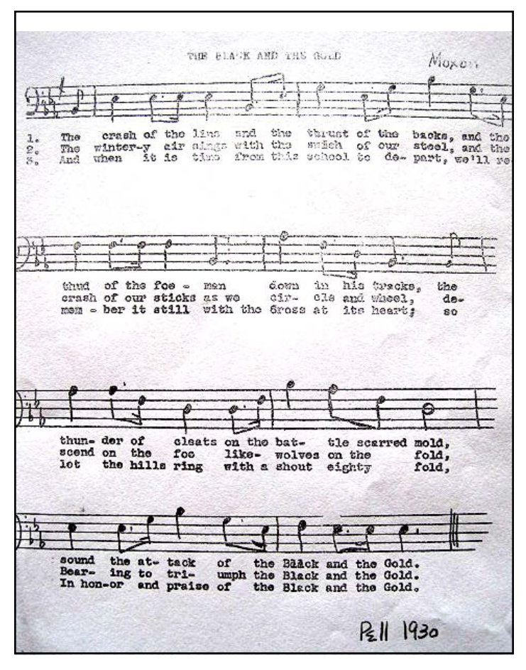
'The Black and Gold'