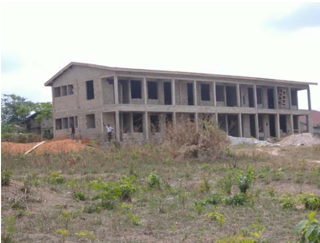
The David Wood Academy, Ghana

(Published in The Berkshire Eagle on 02/24/2008)