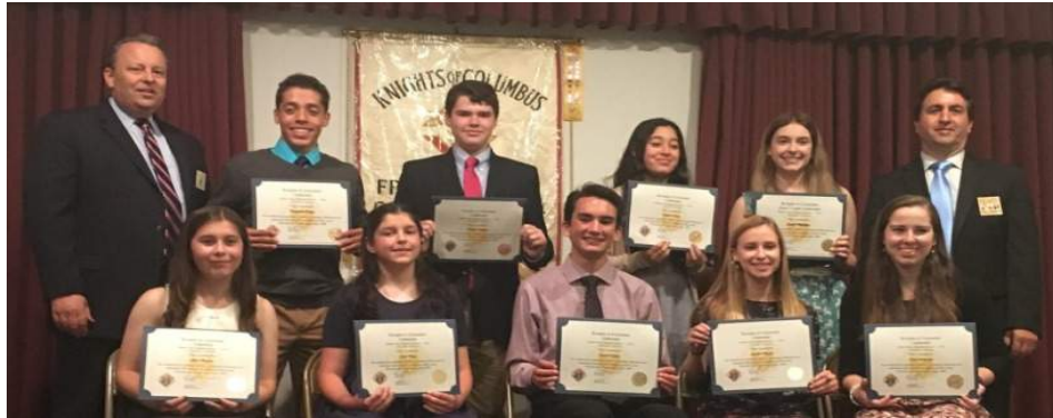
2016 Scholarship Recipients

This event is the culmination of the hard work done year round by the Knights to raise funds for deserving students!