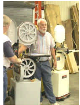
Toys for Tots pictures from November 1st workshop held at Home Depot on Capital Blvd.