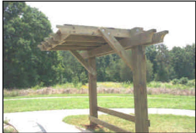
Audubon Society Arbor