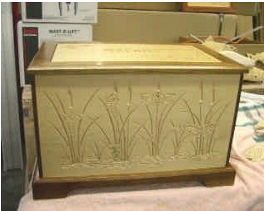
Leon Harkins - explaining some of the finer points of chip carving