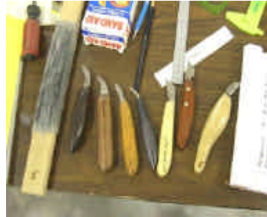
Tools of the trade!