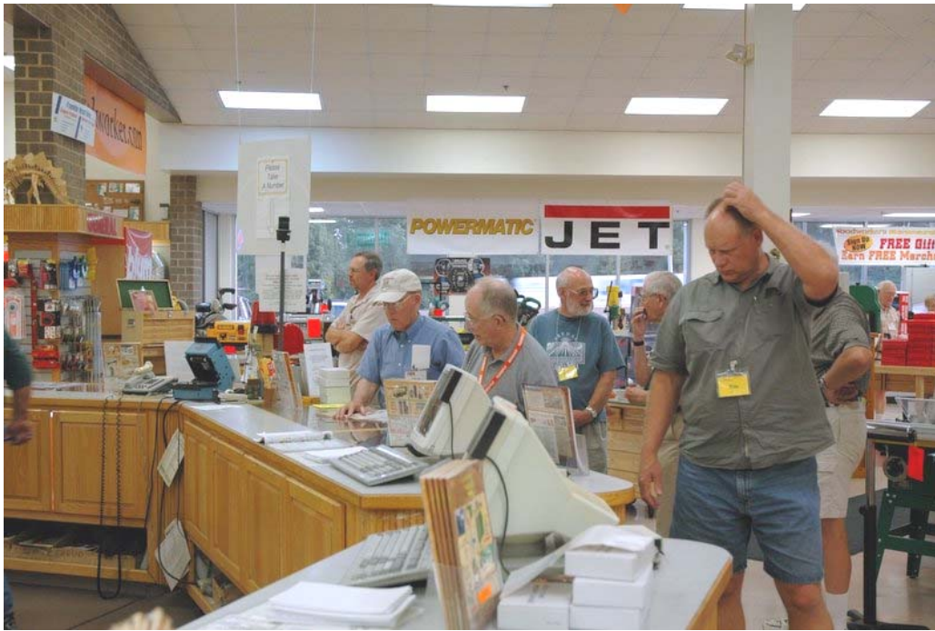
Too Many Choices!