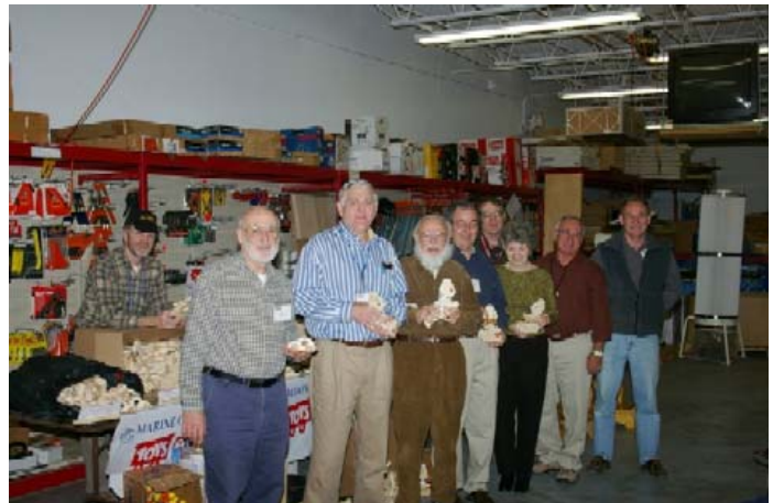
Our own little toy making elves!

CALLING ALL DECEMBER PHOTOGRAPHERS! A number of you took pictures at the December meeting. Would you please send some to TriangleWoodworkers@Yahoo.com ? The ones I took were lost when the backup software I was using wiped out hard drive. That was NOT a typo! I was using a popular backup software and it encountered a problem. Rather than just stopping, it WIPED MY HARDDRIVE CLEAN! So instead of a nice collection of photos from December, I have just these few. Your help would be greatly appreciated.