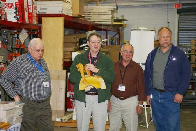
Though none of these guys could use the chair, they did fine work!