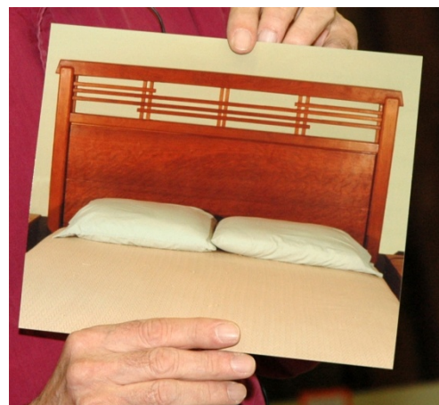
Very nicely done headboard!