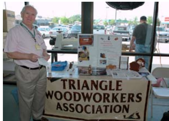
NC Woodworkers Showcase April 26, 2008