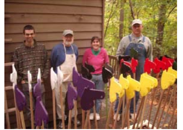
Ponies ready for the artists!