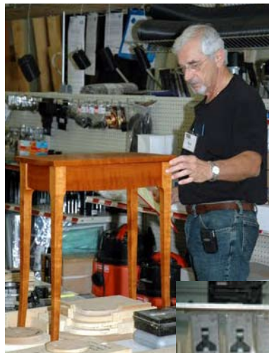
August 2009 A couple of members share "show and tell" items