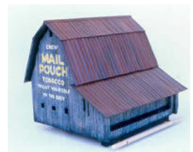
Mail Pouch Ad Barn