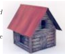
Rutherford County Hen House c. 1897