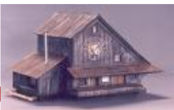
Arney's General Store