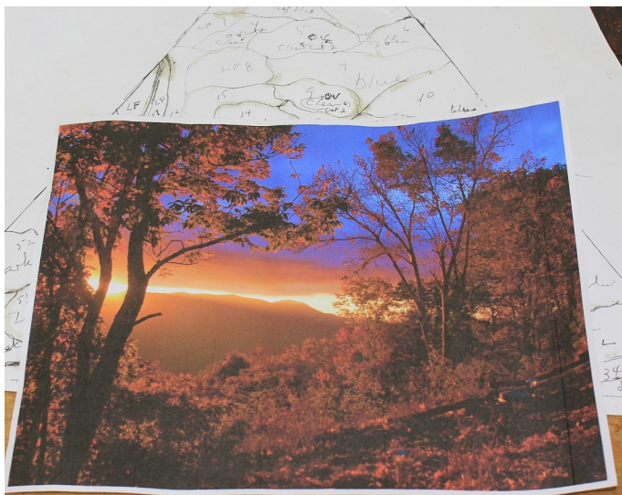
Patty's design process for the stained glass shade

Patty spoke of her interest in stained glass. Patty took pictures of the cabin scenery and made four patterns for the lamp shade glass (truncated square pyramid), after building a mockup. Then she created a pattern for the glass in the lamp base too. The glass is sourced from a local stained glass shop. She uses the copper foil technique as opposed to the lead came technique.