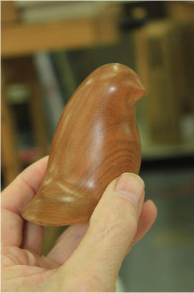
Bernie Bogdon showed this carved bird