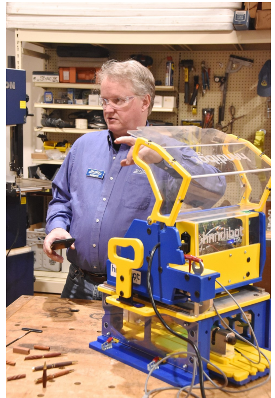
Handibot Demonstration

metal and plastic. Slide in a 4 x 8 sheet of plywood and cut. They now make tools accessible to small businesses and individuals as well as large companies. This allows for the return of small manufacturing to communities by employing the brain-power of the computer and it's programs along with increased speed of robotic production. The whole business started as a concept to