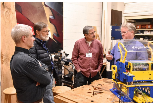
Handibot Demonstration

Finally, there was a demo! Designed with the VCarve Pro we produced a sign and pens. Amazing feats of magic!