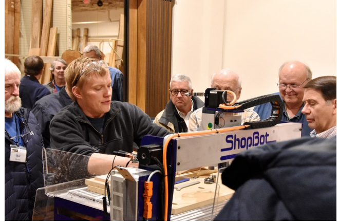
ShopBot Demonstration

The software is easy to use and comes with many tutorials on job set up, drawing tools, toolpathing