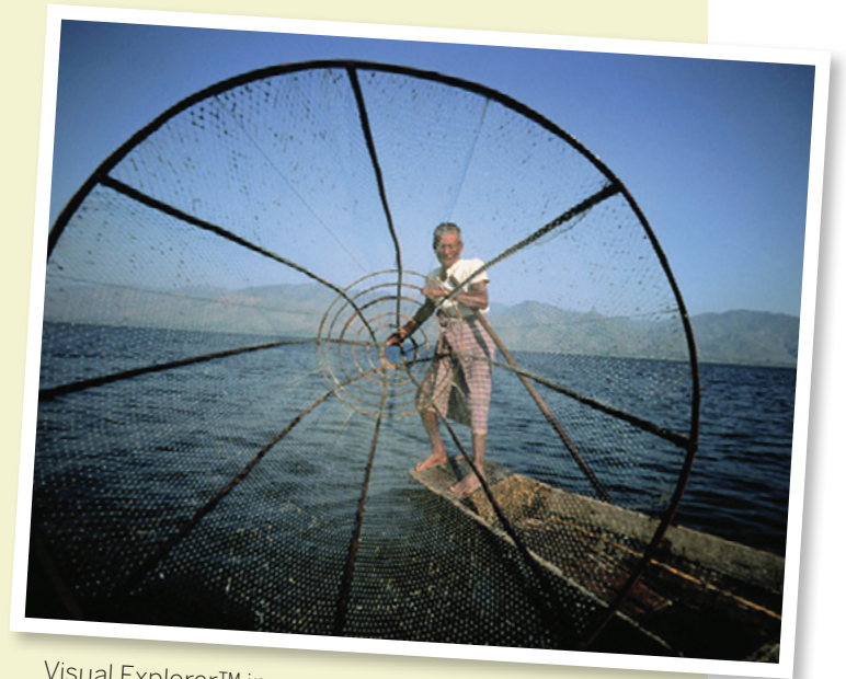
Visual Explorer™ image

Use images to invite groups to consider a dilemma or task. The Visual Explorer™ deck 2 has images that are very evocative and diverse from a race, gender and culture perspective. Make your own image deck from pictures in magazines. Or invite colleagues to bring an object or image that represents their thinking on the topic that will be discussed.