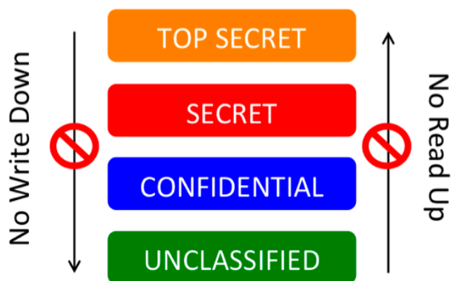
Fig 1: Illustration of BLP Formal Security Model

• The Bell-LaPadula (BLP) model for multi-level security, first outlined in 1973 [1]. In this model, subjects access objects; both subjects and objects have associated security labels. To preserve confidentiality, access is determined according to three rules: a subject may not read data at a higher security level (no read up, or "simple security"), a subject may not write data to a lower security level (no write down, or the "•-property"), and a subject that can both read and write must do so only at the same security level (the "strong •-property").