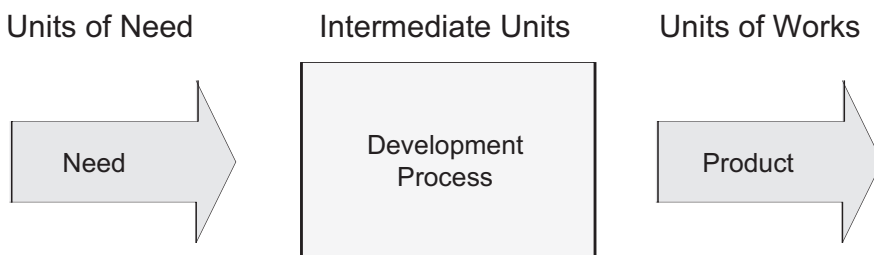
Figure 1: Development Process

Customers have needs. These take the form of requirements that software must fulfill. Developers translate these requirements into intermediate units that they must create or modify to implement the requirements. These can be screens, programs, reports, tables, object classes, interfaces, etc. The list is fluid. Estimators must decompose the intermediate units into IUs to determine a size for estimating.