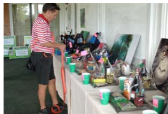
Raffle table had variety of prizes and something for every taste.

Once again golfers teed up to raise money to save gorillas. Brookfield Country Club hosted the 2012 Gorilla Golf tournament. We had 11 golfers paying a minimum of $500 each to play.