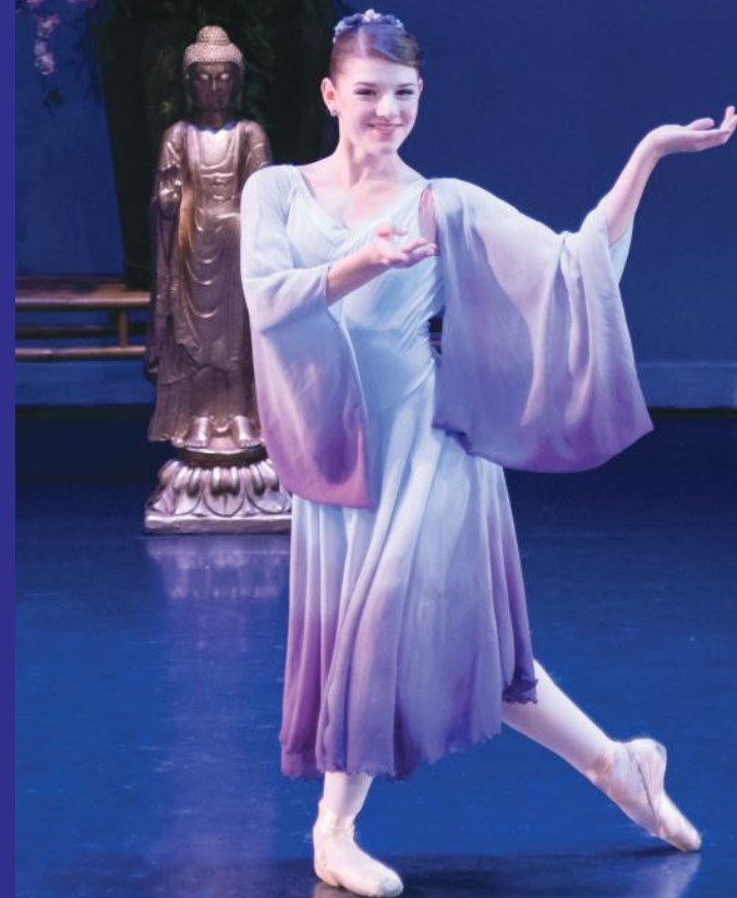
LIZA VOLL PHOTOGRAPHY