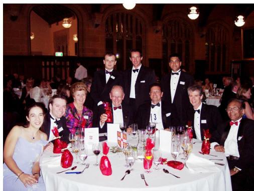
Trivia Quiz Winners