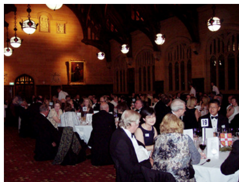
Dinner in MacLaurin Hall