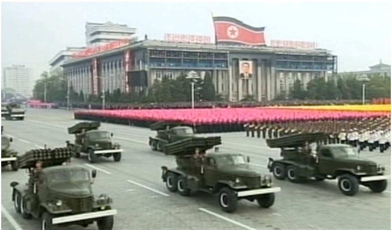
KPA BM-11 122 mm MRL, October 10, 2010