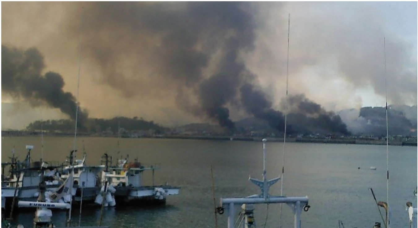
The ROK Island of Yönp'yöng-do under attack from KPA artillery, November 23, 2010.