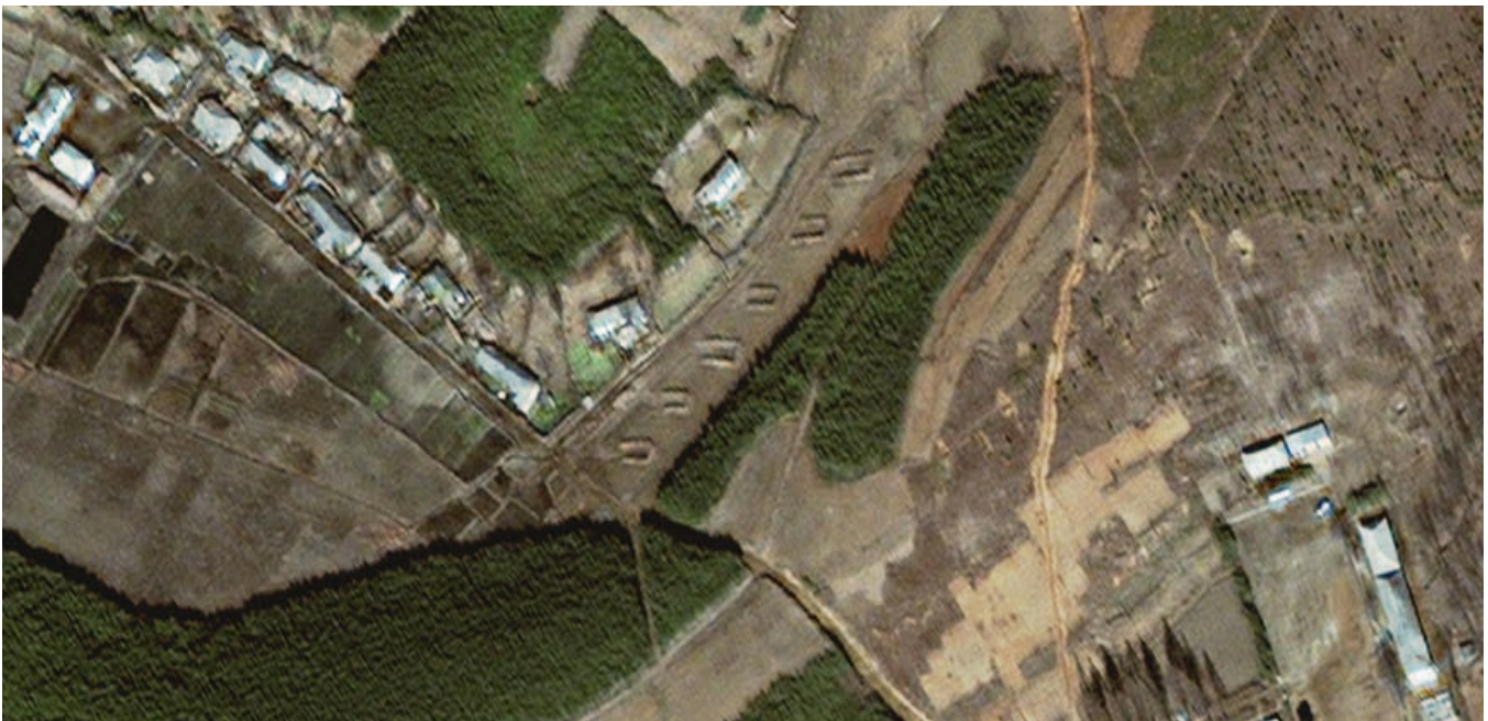
Taken on November 29, 2010, this image shows what is believed to have been the eastern 122 mm MRL battery's original firing position on November 23, 2010. Note the trench for the communications cable from the Kaemöri UGF east of the position.