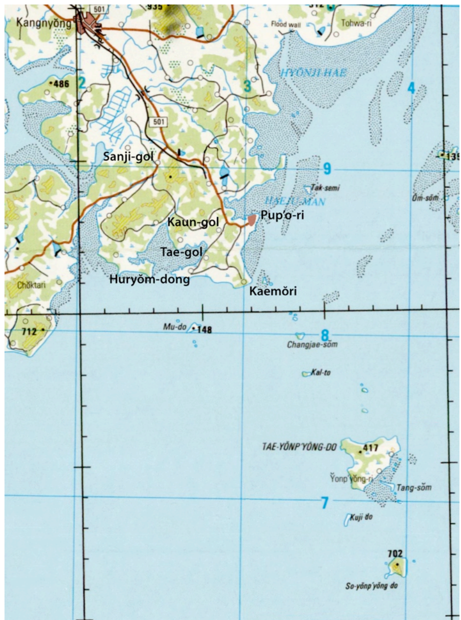
Map of Kangnyŏng-bando - Yŏnp'yŏng-do Area