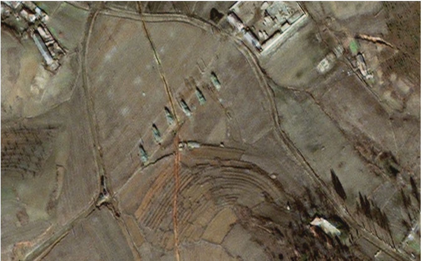
The northern 122 mm MRL battery position on November 29, 2010. Note the trench for the communications cable from the Kaemöri UGF bisecting the position. The camouflaged battery headquarters can be seen approximately 25 m south of the firing line.