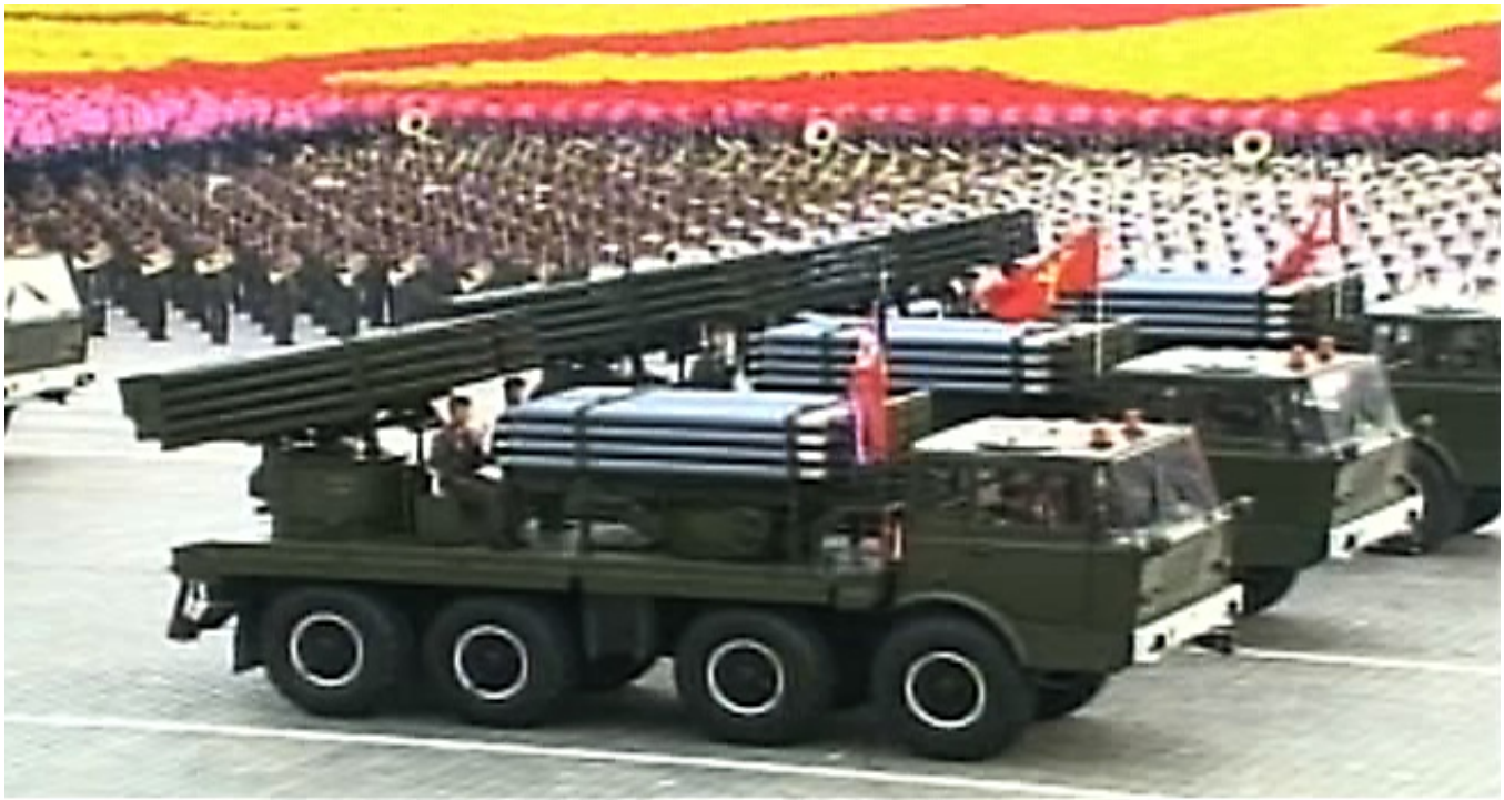
KPA M-1993 122 mm MRL, October 10, 2010

BM-11, M-1985, M-1992 and M-1993. 23 The BM-21, M-1985, M-1992 and M-1993 consist of a 40 launch tube assembly, while the BM-11 has a 30 launch tube assembly. Maximum rate of fire for these systems is 2 rounds per second. Given the dimensions of the prepared firing positions and the size of the vehicles themselves it would appear that the battalion was equipped with the M-1985, M-1992 or M-1993 MRL.