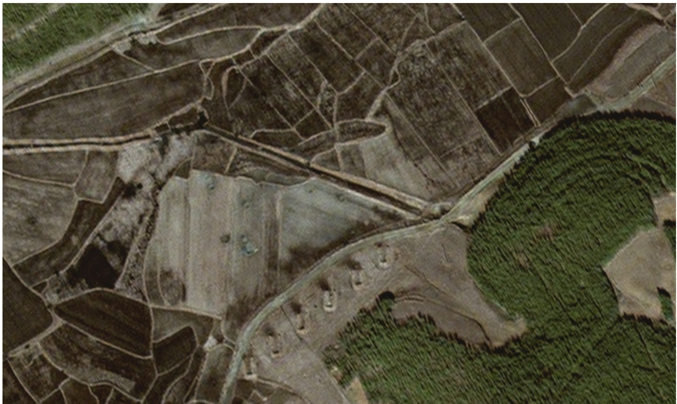
Taken on November 29, 2010, this image shows what is believed to abandoned position of the southern 122 mm MRL battery. This is the position from which the attack on Yönp'yöng-do was conducted. Note the burn marks from the launch on the northern side of the individual positions and the impact craters from the 155 mm K-9 counter-battery fires just north and west of the firing line.

At 15:45 hours the ROK JCS ordered the intelligence watch status of the armed forces be upgraded from watchcon 3 to watchcon 2. The defense condition—defcon, how-