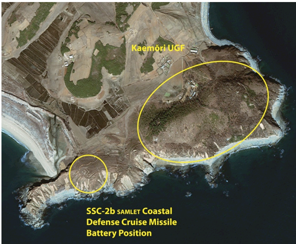
Kaemŏri UGF and Coastal Defense Cruise Missile Position, November 29, 2010

smaller artillery exercises were held throughout the year across Hwanghae-namdo including several immediately north of Yŏnp'yŏng-do.