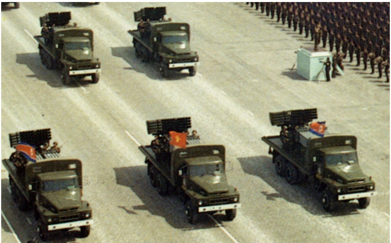
KPA M-1992 122 mm MRL, 2002 (KPA)