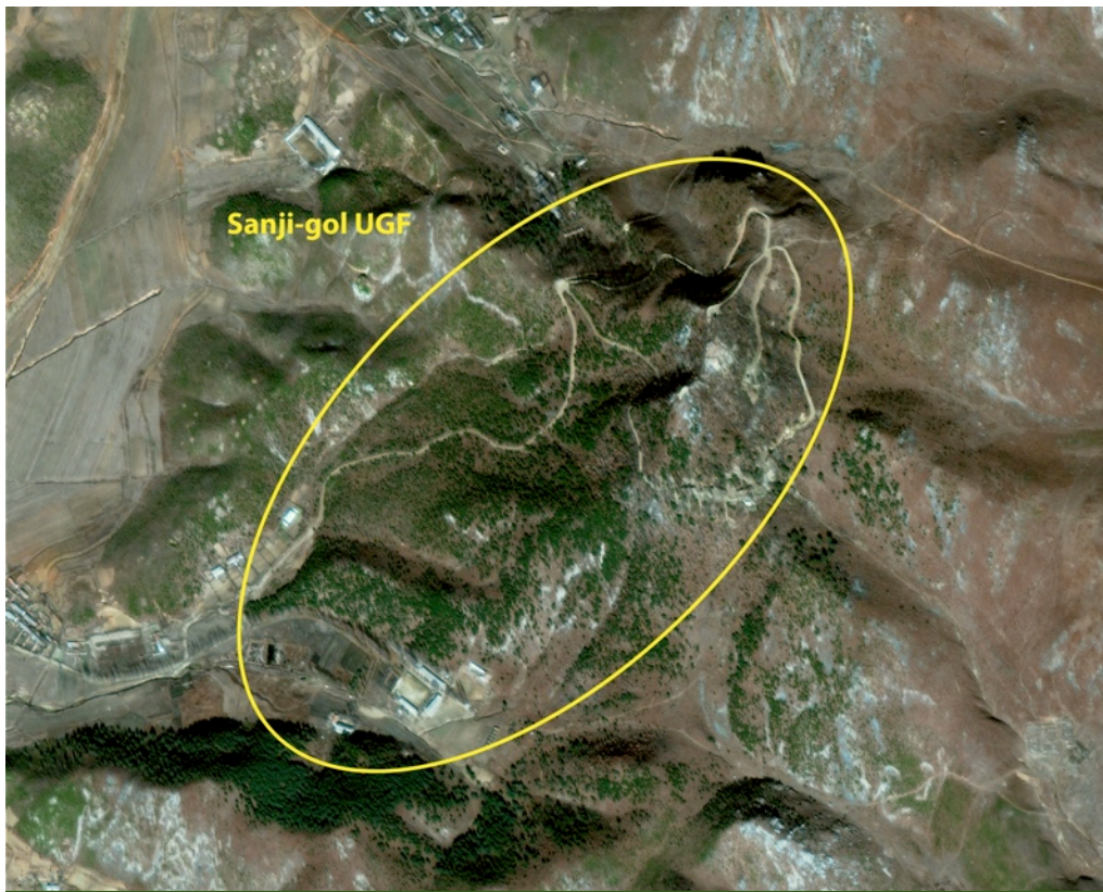
Sanji-gol UGF, November 29, 2010