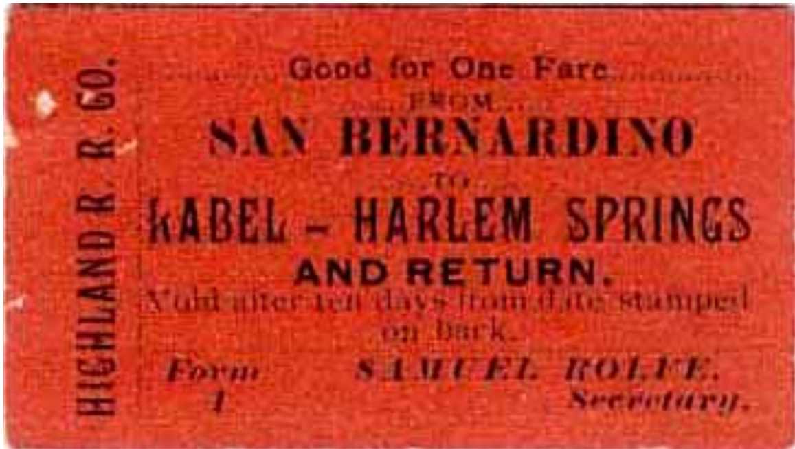
...and 1887-1903 for the Highland Railroad Company