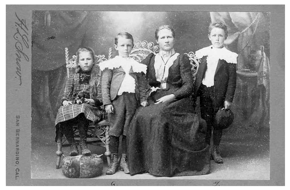
The identities of these people are unknown. Can anyone provide information on them?