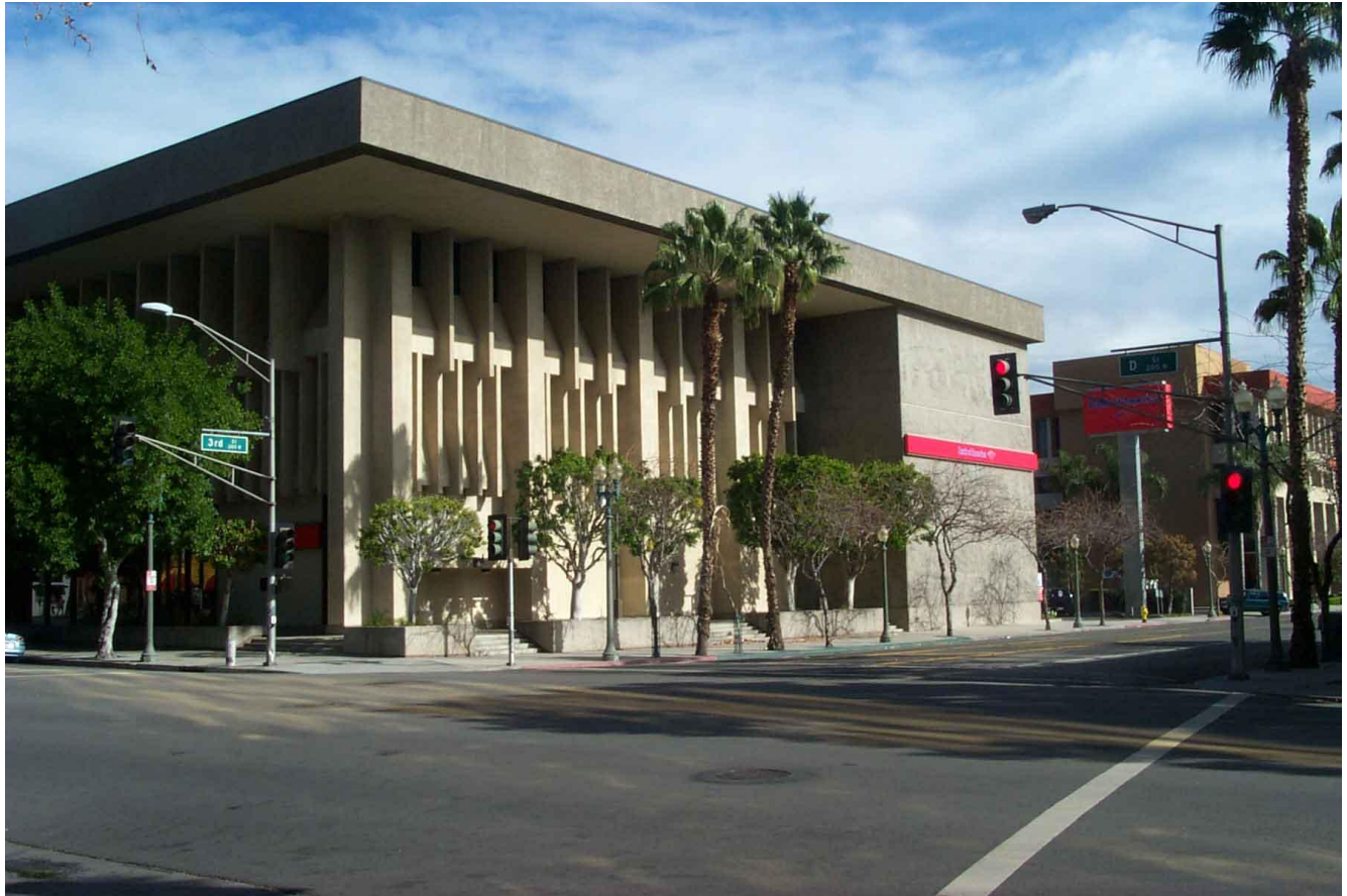
Paul Williams designed the Bank of America at 303 N. D Street

In 1965 Williams designed the Bank of America building at Third and D Streets. The October 10, 1965, issue of the Los Angeles Times has the architect's sketch of the building with a caption stating that the second floor "will house executives for entire San Bernardino area." I went to the bank and asked if there were still executives on the second floor and found out that there were four floors altogether. This is not readily apparent from either the outside or inside of the building. One employee told me that the second and third floors had been abandoned and gutted several years ago, and the executive operations had moved to an Orange County facility. In the late 1990s NationsBank acquired Bank of America, but the deal was structured as a merger so that the name "Bank of America" could still be utilized.