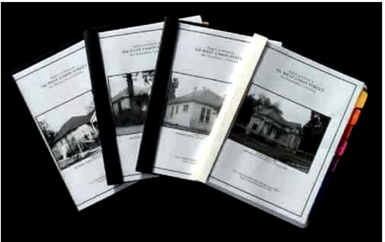
Historic house reports using Donaldson's study data and other documentation

We then add miscellaneous documentation to the file, such as a copy of a historic Sanborn Fire Insurance Map, and property profiles from sources like Zillow.com. After we write a two- or three-page overview of the pertinent section of town, we have a nice individualized historic report. I have prepared four of these for houses on West Union Street (between 8th and 9th, west of E Street) to see how much time is involved. Perhaps we can have a Saturday seminar to show any interested parties how to prepare such a report.