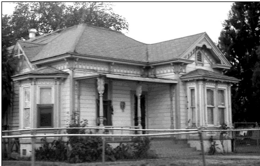
551 West Union Street – “Italianate” Architectural Style