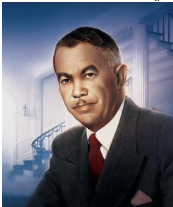
Paul Revere Williams, 1894–1980

There are banquet and dining rooms, plus a coffee shop, pool hall and pro shop. In the large entrance lobby is an arcade housing many electronic video games. If this was a game room in the 1960s, all the games would have been mechanical rather than electronic, and in my memory the machines back then produced sounds pretty much like the electronic acoustics I heard when I visited that day.