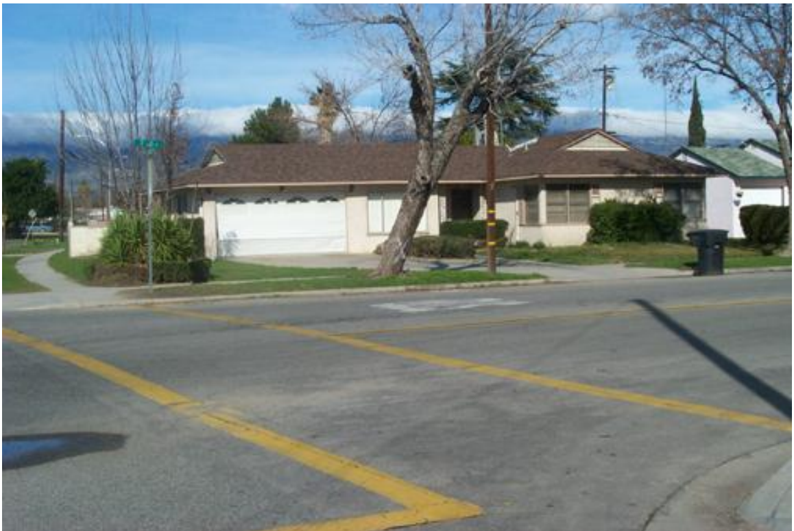
Carverdale tract: three-bedroom, two-car garage home, corner of 7th and Medical Center Dr. – Jan. 2010

Saving The Past For The Future Since 1888