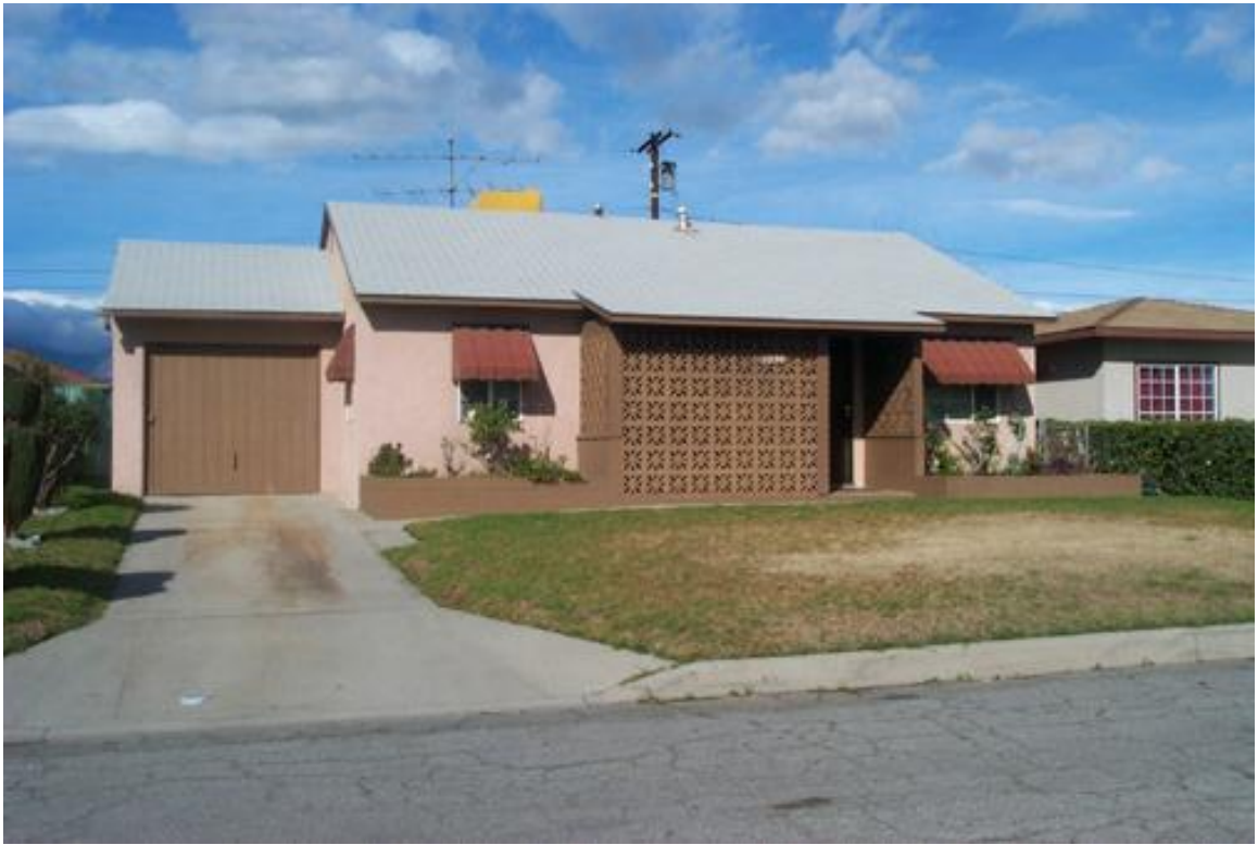
Carverdale tract: two-bedroom, one-car garage home on Vine Street – Jan. 2010

famous movie stars as Lucille Ball/Desi Arnaz, Tyrone Power, Zasu Pitts, Bill “Bojangles” Robinson, Barbara Stanwyck, and Johnny Weissmuller, among others.