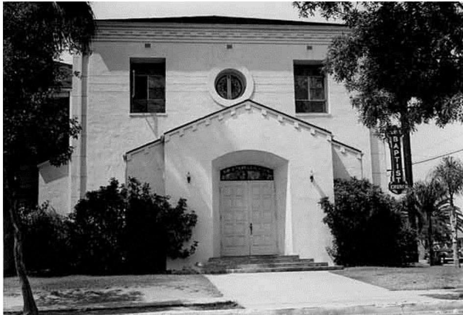
Calvary Baptist Church, 18th and E Streets

Saving The Past For The Future Since 1888