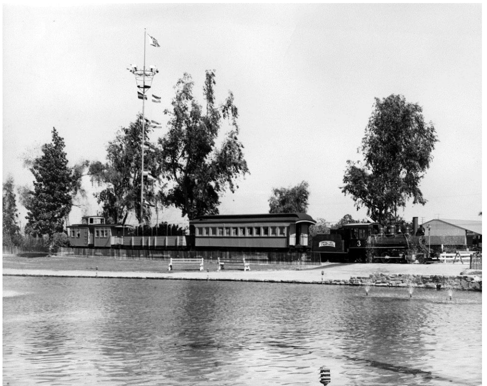
Dale Gentry's reduced-scale train at the Orange Show - 1960