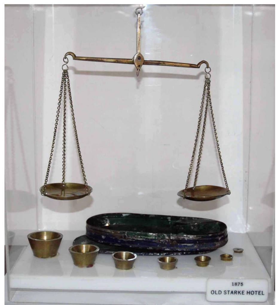
Antique Gold Scale – circa 1875

Chief among the items in this donation is a gold-weighing scale that used to sit behind the check-in counter at the hotel. William had the scale placed in a plastic display case and dated the item to 1875. At that time it was common to be paid in gold dust. The Starke donation also included an inkwell and a rather unusual bottle.