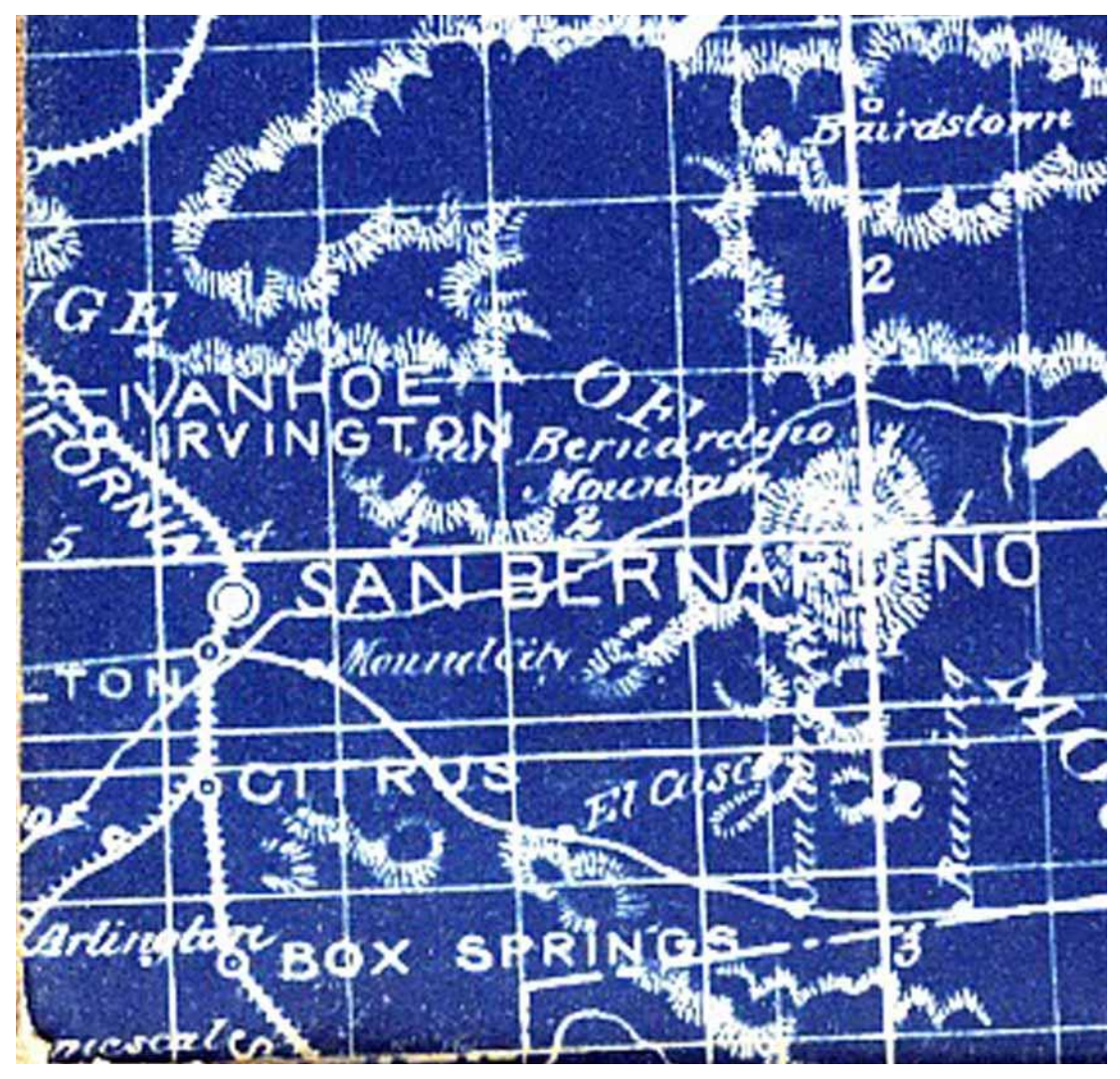
Portion of California Southern Railroad Map

The map when folded is 4 1/4" x 6 3/4" and can easily be slipped into a jacket pocket. In 1880 Santa Fe Railway interests created the California Southern Railroad for the purpose of constructing a rail line from San Diego to what is now the City of Barstow. According to a well-written Wikipedia entry, the Santa Fe purchased the California Southern outright in 1906, thereby ending the latter's subsidiary status. <u>http://en.wikipedia.org/wiki/California Southern_Railroad</u> Thus the map very likely was created in the time frame 1880 to 1906.