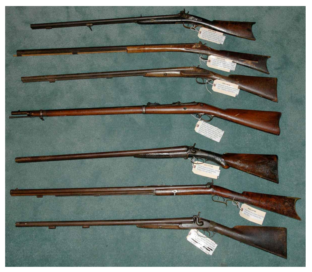
Uncle Billy Holcomb's Guns

hexagonal barrels that were the style at the time. Even though these guns are well used, they will make a fine addition to our existing collection of about a dozen firearms (rifles, shotguns, and one handgun).