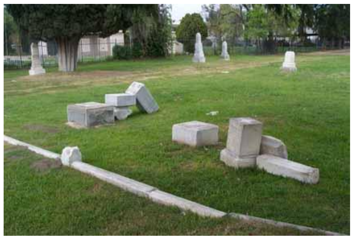
Toppled tombstones show vandalism is still a problem at Pioneer Cemetery