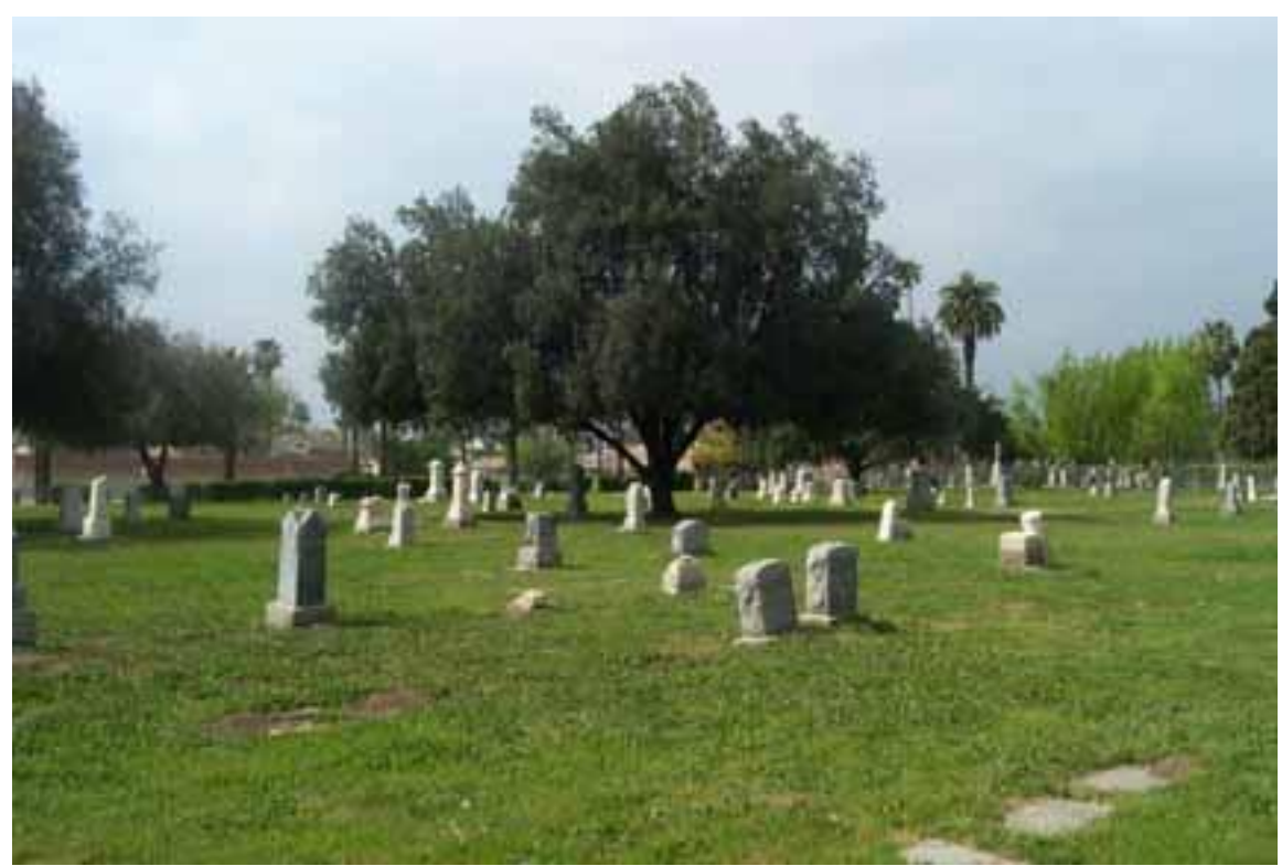
Headstones in the old section of Pioneer Cemetery

We probably won't be spending much time visiting the Seccombe Lake Cemetery on our tour, as there is nothing to see. It is all grassed over. No matter – there is plenty to keep us busy at Pioneer Cemetery.