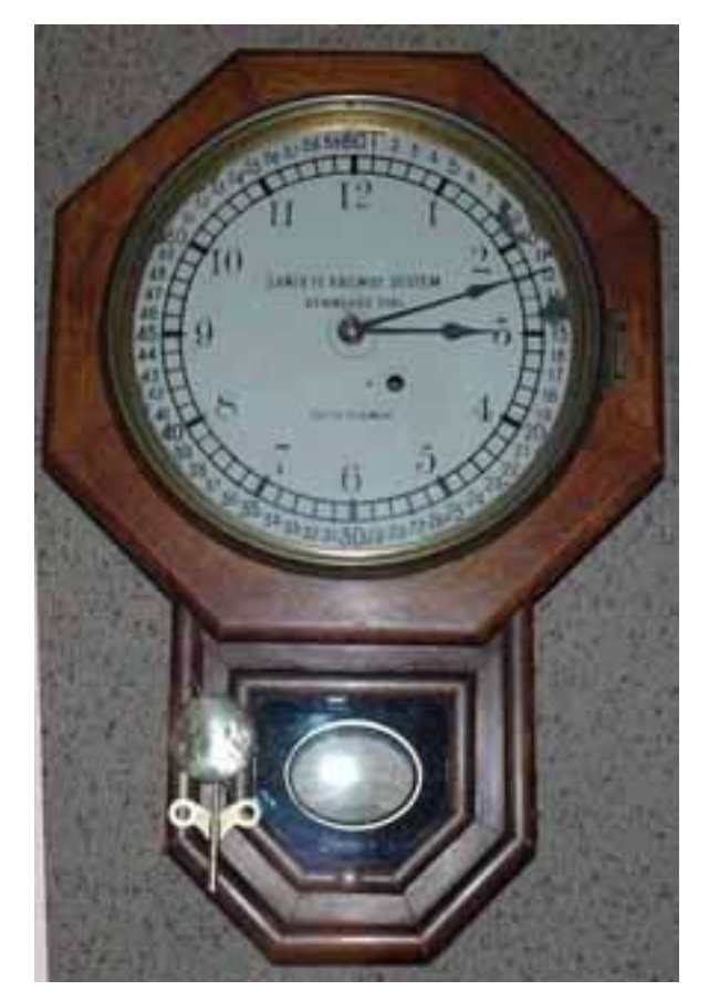
Santa Fe clock