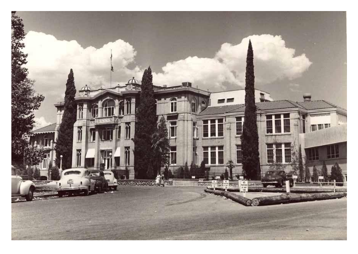
County Hospital, Gilbert Street – September 1, 1955.