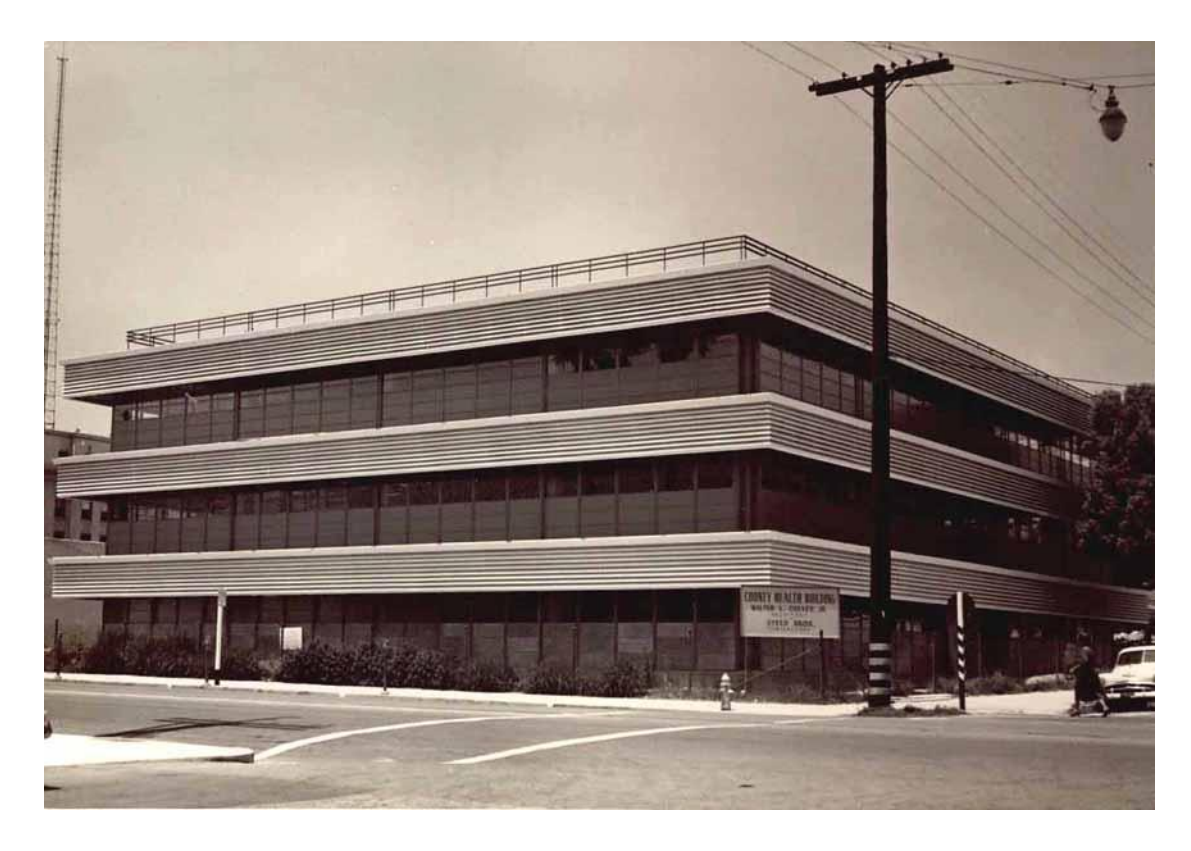
County Health Building, northwest corner of Third St. and Mt. View Ave. – June 11, 1953