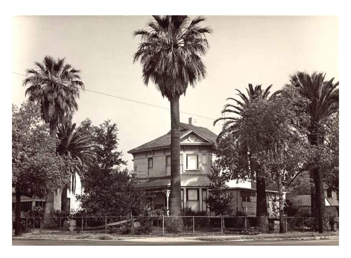
House at northwest corner of Seventh and G Streets. This was still a nice middle-class neighborhood at mid-century – July 15, 1961