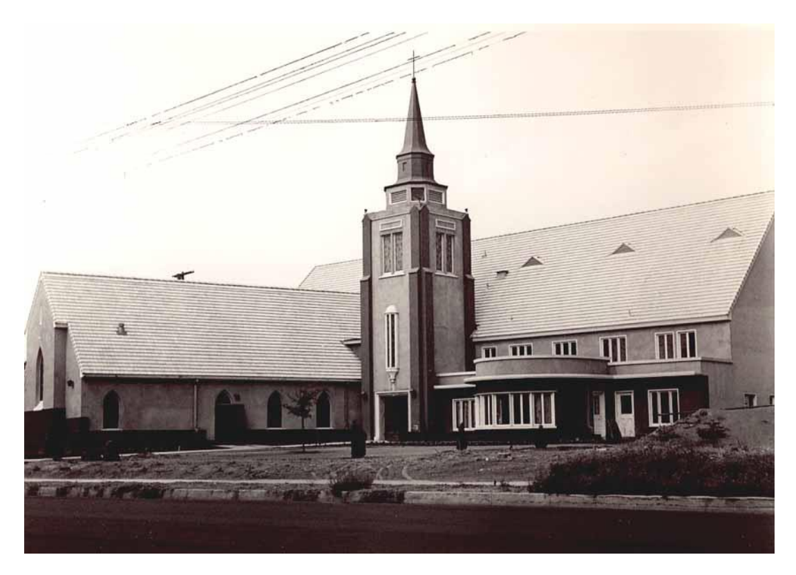
First Baptist Church, Tenth and G Streets –July 25, 1952