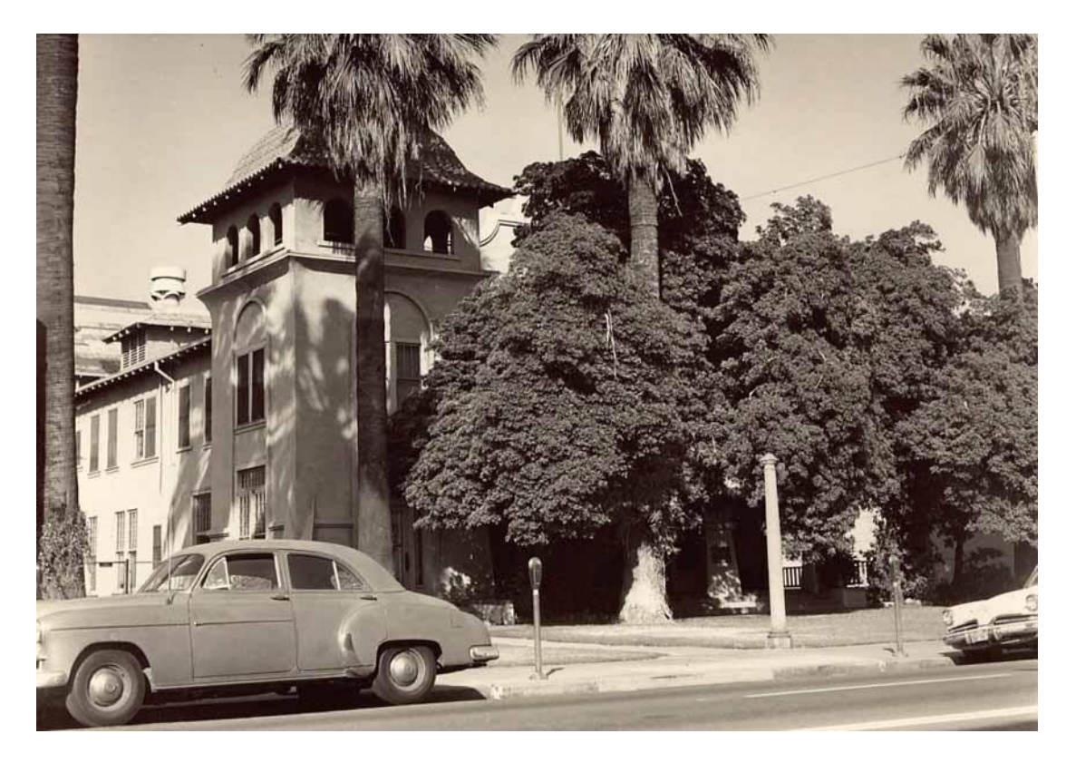
Elks Club, 466 Fourth Street - Oct. 27, 1960