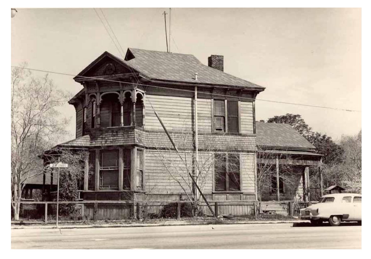
Home of Judge Benjamin Harrison's parents, Second and Allen Streets – April 1, 1961

Following are some of the photographs.taken by Clarence Jarvis.