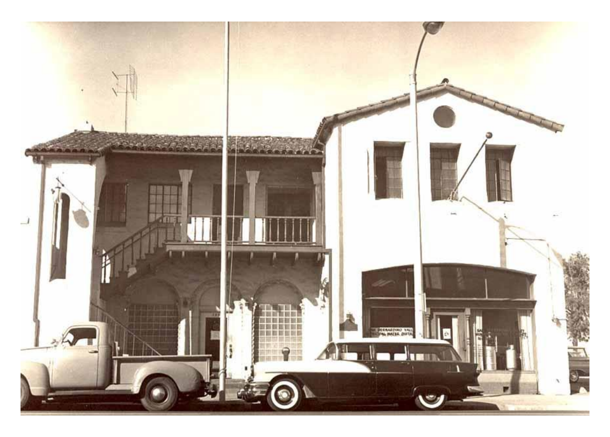
American Legion Hall, 388 Fourth Street – October 27, 1960