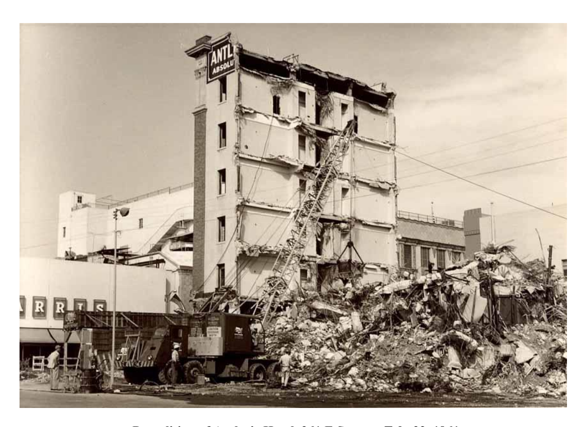
Demolition of Antler's Hotel, 261 E Street – Feb, 22, 1961

SAVING THE PAST FOR THE FUTURE SINCE 1888